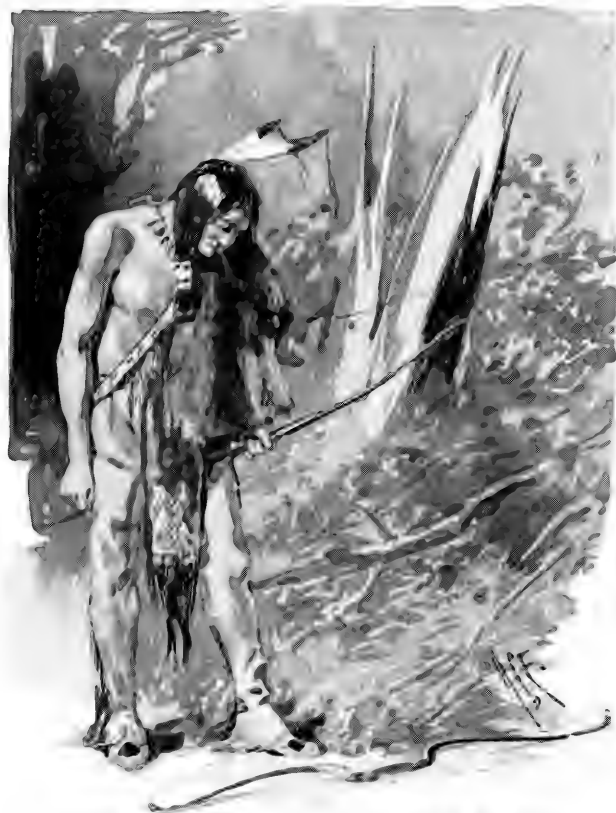
AMONG THE SPAINIARDS LIES A POLISHED BOW. 11 —Page 33.